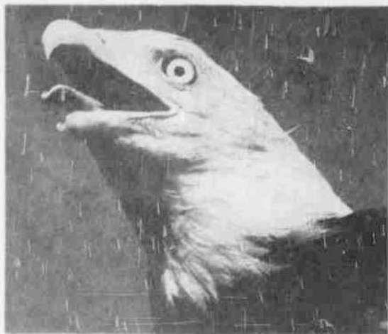
Symbol Of Many Things

A fraternal organization has named itself for this great white-headed hawk,